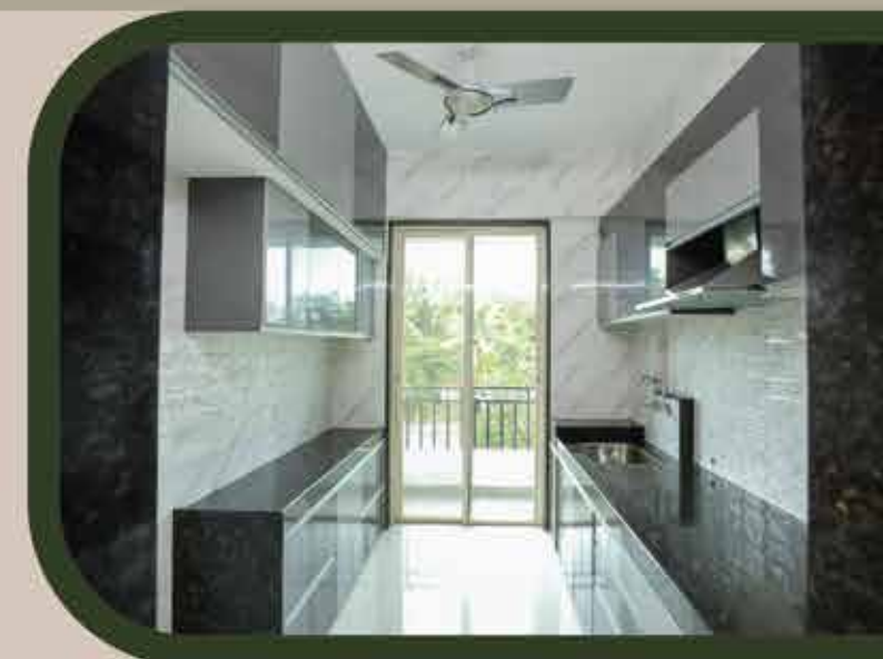
Actual Photograph of 1 BHK Show Flat in Building No. 1

There is no match for the super-sized bedrooms at Ashiyana infinity. These massive bedrooms will spoil you with unparalleled comfort and panoramic views from huge floor-to-ceiling windows.